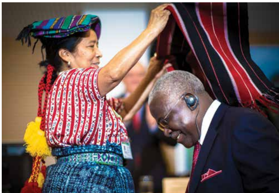
The President of IFAD Mr Kanayo F. Nwanze at the opening of the Forum during the indigenous ceremony