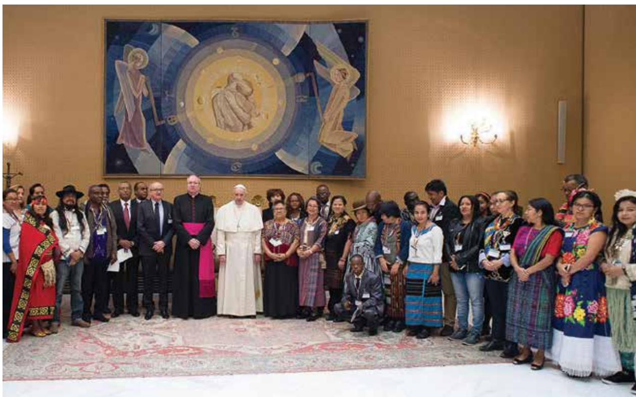
Pope Francis receives the indigenous delegation in a private audience