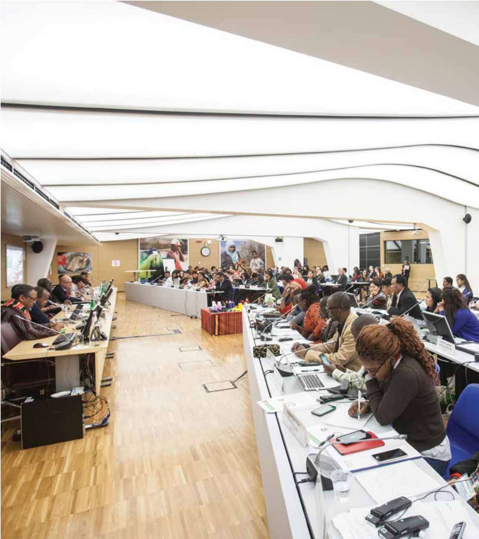
Opening session of the Forum