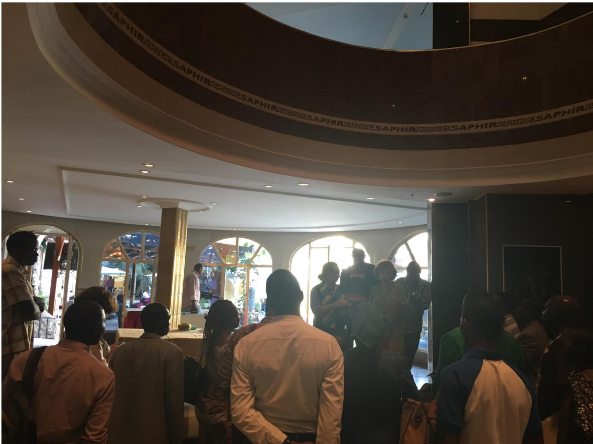
A picture from the Regional Consultation held in Brazzaville

The last segment of the workshop was an indigenous peoples' art fair, to which participants donated handicrafts to IFAD that would be part of the "IFAD Indigenous Peoples' Place" to be inaugurated by the President of IFAD during the global meeting of the Indigenous Peoples' Forum at IFAD in February 2017. IFAD's representative received several handicrafts from indigenous peoples' representatives, who explained the cultural value and use of each of the objects.