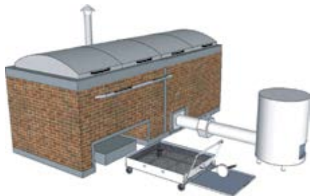
Figure 18.3 An Improved Smoking Kiln: The Thiaroye Fish Smoking Technology

time, given that fish processors are predominantly women. According to the latest statistics, in most fishing communities as many as 90 percent of workers in processing activities can be female (FAO 2014). Women, therefore, bear the brunt of the drudgery and health problems related to drying and smoking fish.