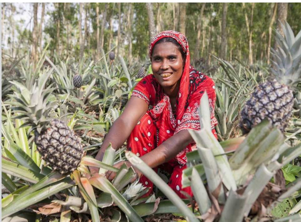
Pineapple cultivation, Bangladesh