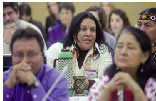
Representative from Latin America and the Caribbean

The objectives of the workshop were to (1) disseminate information about IFAD's Policy, which is not well known; (2) consolidate common positions to be conveyed at the Forum; and (3) clarify aspirations related to the Forum. In preparation for the workshop, three case studies were conducted, in Ecuador, Guatemala and Nicaragua.