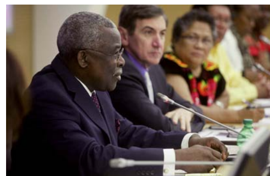
Opening Statement of IFAD President Kanayo F. Nwanze

For the full statement of IFAD President Kanayo F. Nwanze see annex D.