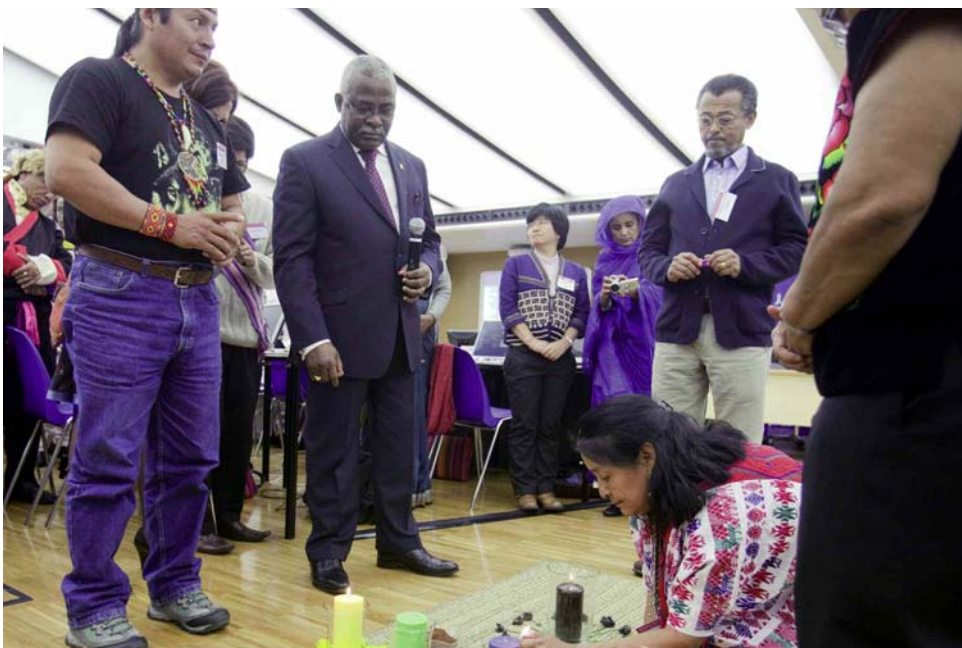
Opening ceremony of the first global meeting of the Indigenous Peoples' Forum

This report summarizes the first global meeting of the Indigenous Peoples' Forum at IFAD. This brief text cannot provide a verbatim account of the Forum deliberations or do justice to the wealth of comments and insights, experiences and stories that were shared. Rather, the report provides an overview of the main messages conveyed, the key topics discussed, the recommendations put forward by indigenous peoples' representatives and the regional action plans jointly agreed upon by IFAD and indigenous participants. For those interested in learning more, the report provides links to background documents, case studies, videos, photos, interviews and further reading.