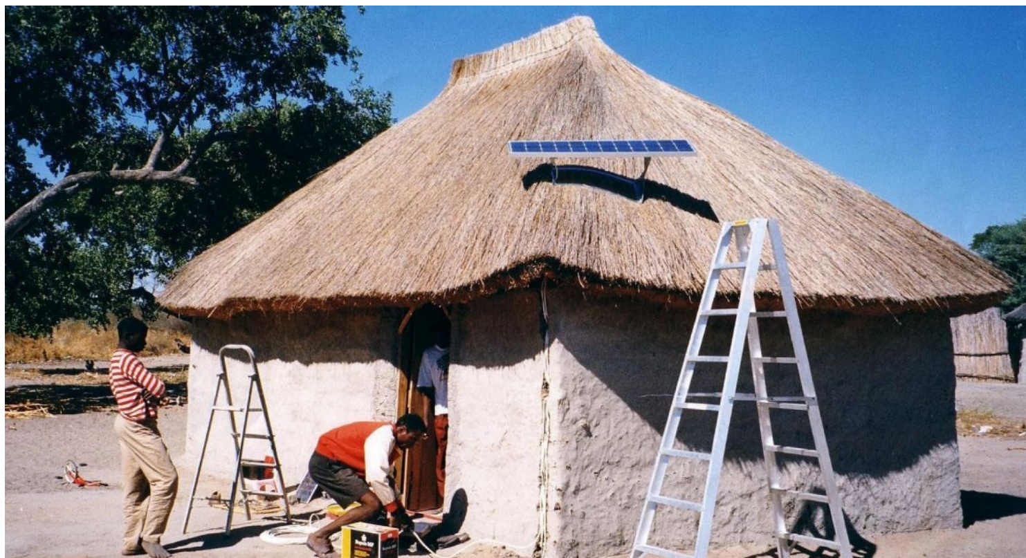
Installation of a solar home system near Bukalo in the Zambezi Strip, Namibia.