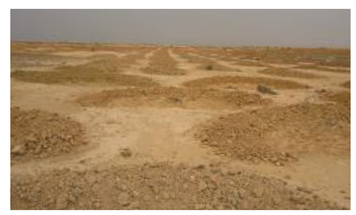
Before and after restoration through half-moons (these photographs are examples of the same techniques used in the Niger).