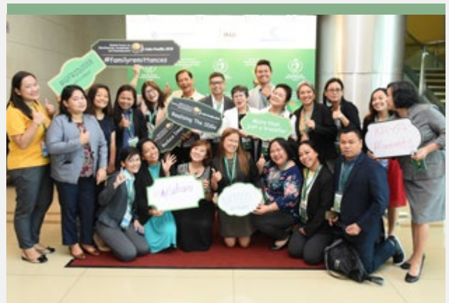
GFRID 2018 participants from the Philippines at the photo booth