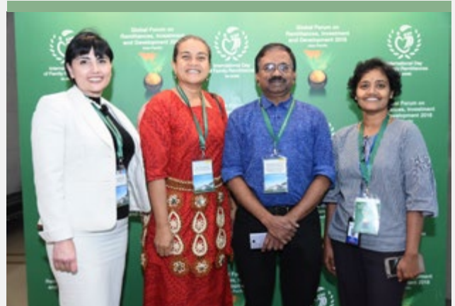
GFRID 2018 participants at photo booth