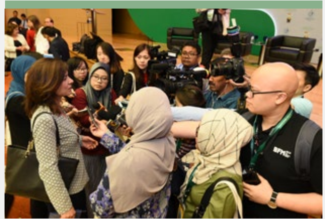
Ceyla Pazarbasioglu (World Bank Group) interviewed by journalists after opening remarks