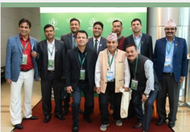
GFRID 2018 participants from Nepal at the photo booth