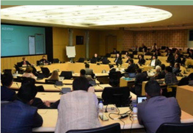
One of GFRID 2018 side panels