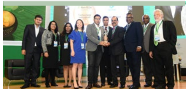
Winners of the RemTECH Award