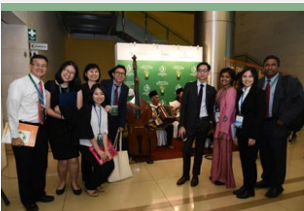
Group picture at reception, after closing of Day 1