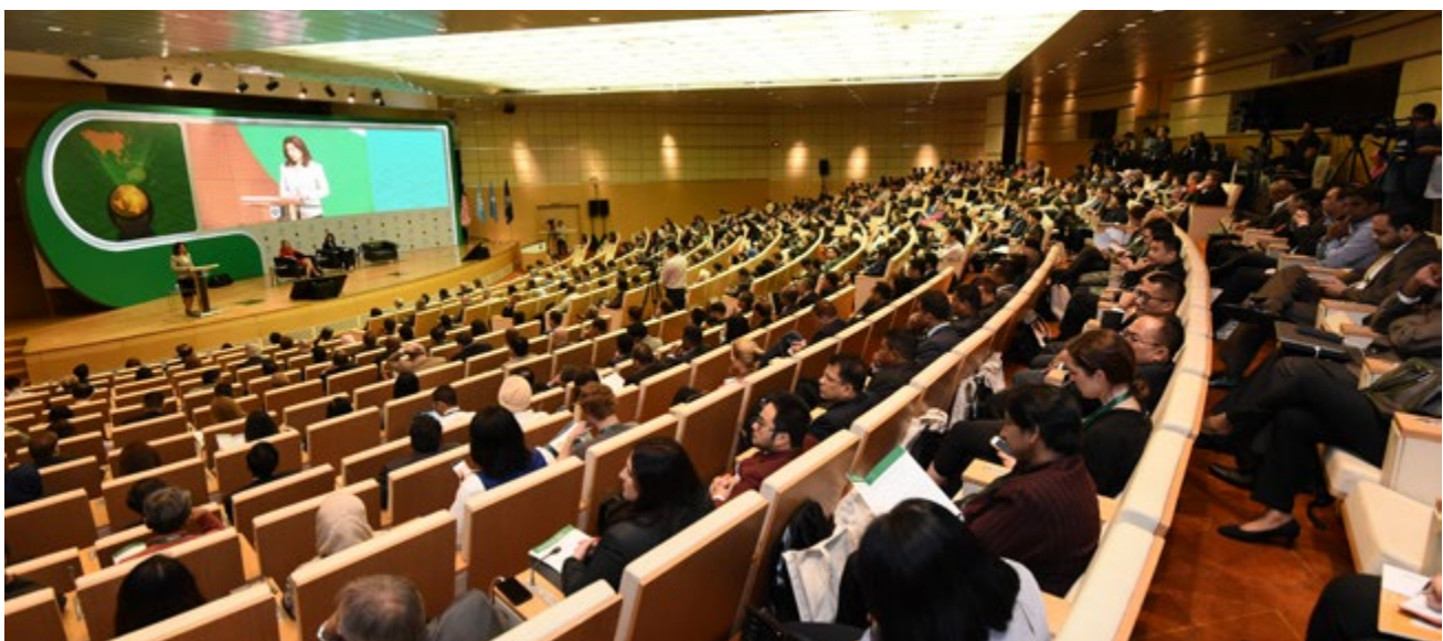
GFRID 2018 plenary