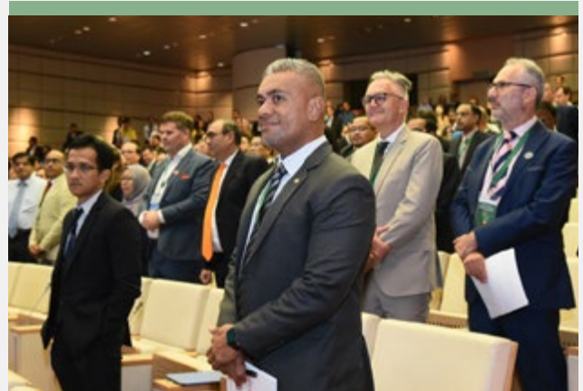
GFRID 2018 participants during opening ceremony