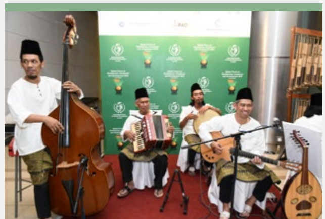
Traditional musicians at GFRID 2018