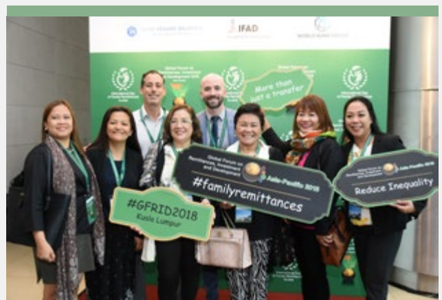
GFRID 2018 participants and organizers at the photo booth