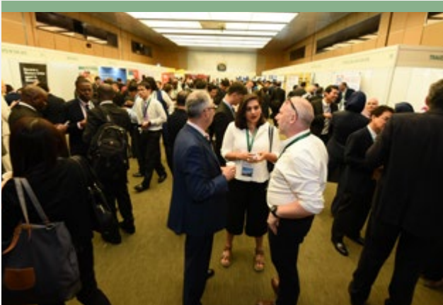
Networking at the Remittance Marketplace