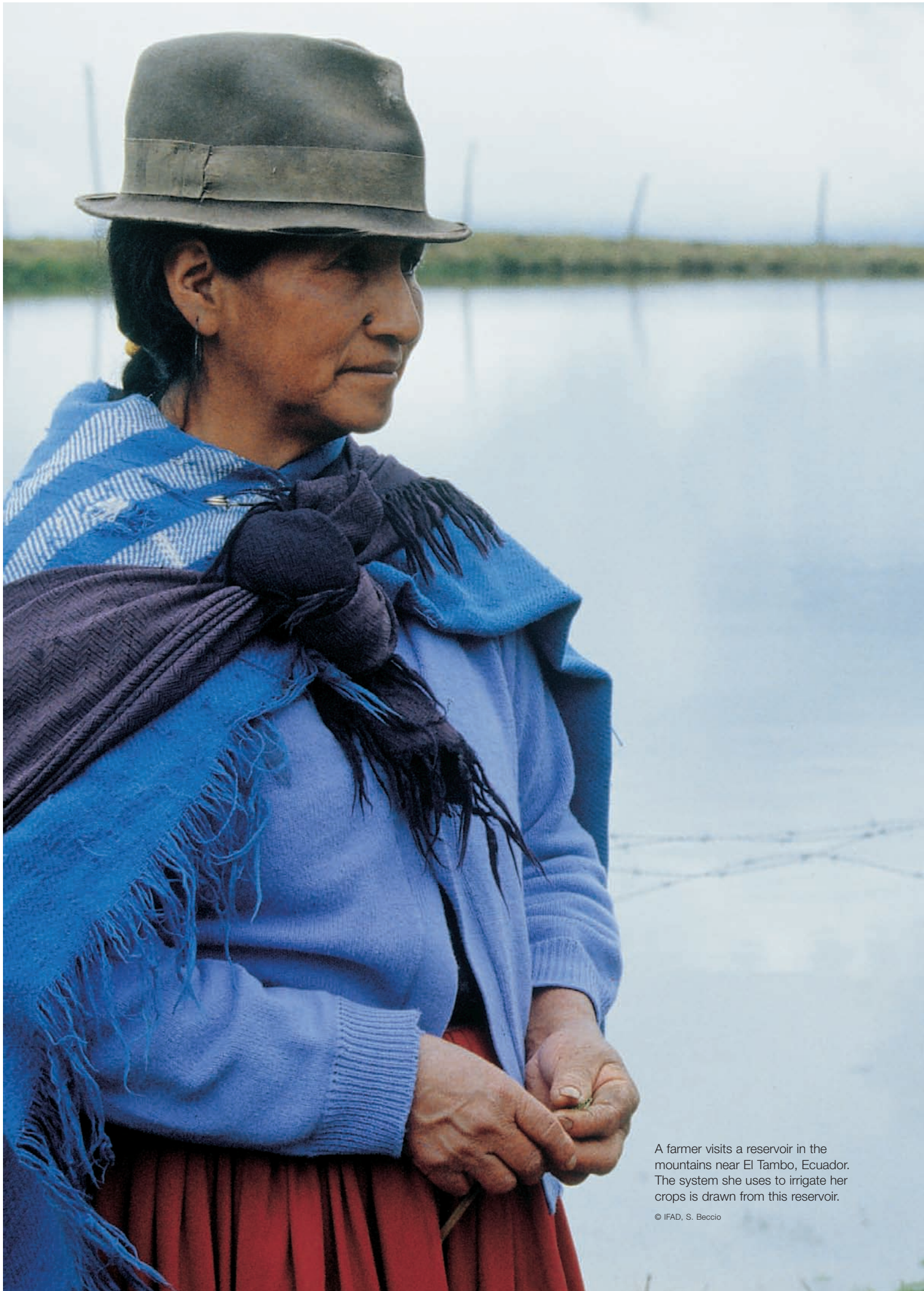
A farmer visits a reservoir in the mountains near El Tambo, Ecuador. The system she uses to irrigate her crops is drawn from this reservoir.