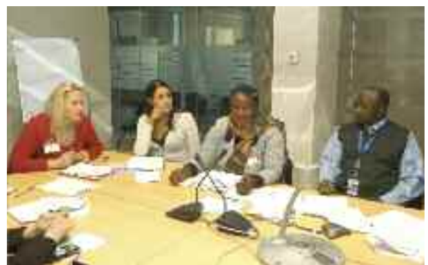
Group Session, West and Central Africa

Regarding the role of farmers’ organizations with respect to women, it is important not only for women’s issues to be addressed in the organizations, but also for women to have the possibility of being elected to key positions and reach certain levels within their organizations. Women should have their own organizations. However, the women in the women-only organizations should not be part of the quota of the mixed organizations. At the same time, there are broader cultural and traditional challenges, which could be addressed if the issue of quotas were taken on in government policy as an across-the-board mechanism, and not just one to be applied to farmers’ organizations. The entire policy of a country should be pro-woman, with, for example, 5 per cent women in all leadership domains.