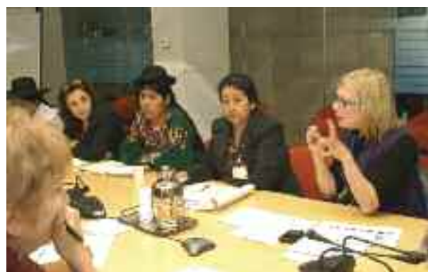
Group Session, Latin America

The issue of quotas emerged again during the working group discussions. Most participants believe that if quotas are not adopted, it is almost impossible to assure even a low level of women's participation. Ideally quotas would not be needed, but they are needed now to assure that women are present and involved. Moreover, quotas are important not only to ensure the participation of women in associations and organizations, but also other areas where oversight is required, such as government policy. However, quotas as such are not enough, but must be accompanied by technical training, capacity building in advocacy, and