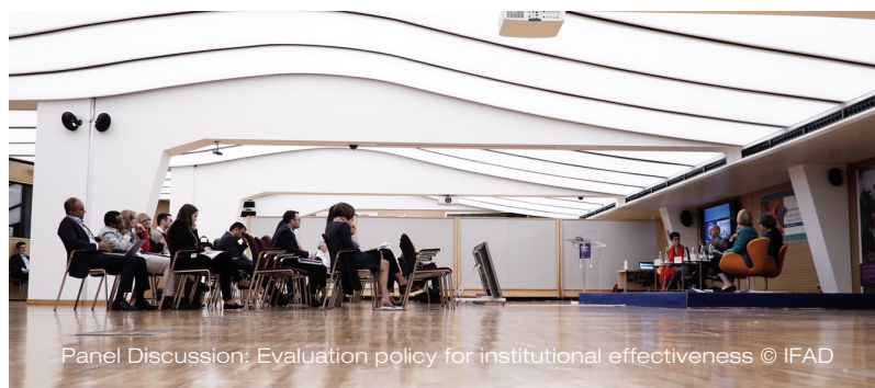
Panel Discussion: Evaluation policy for institutional effectiveness © IFAD

The RMF provides indicators for outcomes (e.g. SSTC contribution to country programme objectives and capacity enhancement) and outputs, such as number of solutions, knowledge products and partnerships promoted.