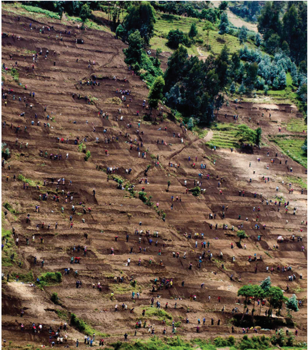
Local community members participating in construction of graded terraces to control soil erosion in Nyabihu District, Rwanda.