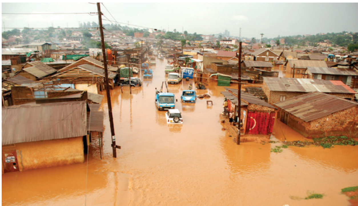
Flooding in Kaverle, Kampala.

To help cities better address the impacts of climate change, the United Nations Office for Disaster-risk Reduction and UN-Habitat have mobilized over 1 800 cities and local governments to commit to 10 essential policies to make their cities more resilient. To date, over 700 cities have assessed their own progress in implementation.