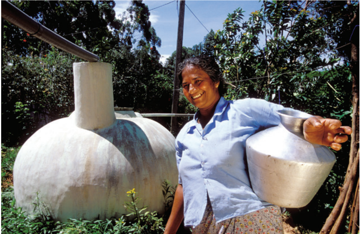
Woman with water jug next to rain water collection tank, Sri Lanka.

and of respiratory illnesses from urban air pollution. Reducing pollution and strengthening local resilience to climate impacts bring large and immediate benefits. In addition to saving lives, this reduces health costs and increases social well-being and productivity.