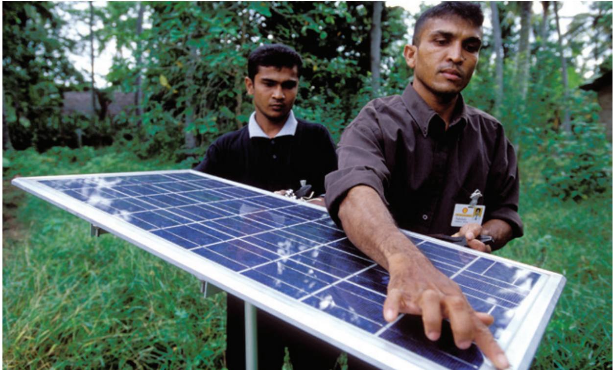
Solar panel used for lighting village houses, Sri Lanka.

The UN is also establishing a technology bank and a supporting mechanism for science, technology and innovation designed to assist LDCs. As requested by the United Nations General Assembly, the Secretary-General will constitute a high-level panel of experts to carry out a feasibility study to examine the scope, functions, and institutional linkages with the UN and other organizational aspects of the technology bank. The bank is expected to be operational by 2017.