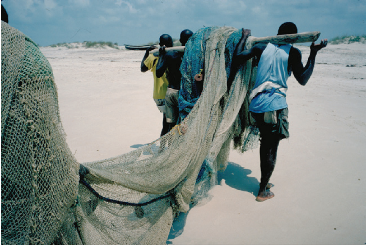
Fishermen carry nets back to their village in Mucoroge, Mozambique.

as 80 per cent of food consumed in much of the developing world. The resulting impacts on food security affect the wider community and can spill over into national and regional insecurity.