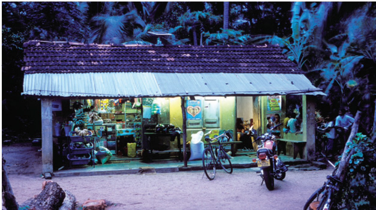
A village shop in Sri Lanka at dusk lit by solar lamps.

Coal, oil and gas have fuelled the world's industrialization and contributed enormously to economic development and human well-being. As a result, however, energy-related carbon dioxide (CO 2 ) emissions currently account for some two thirds of global GHG emissions. As the global economy expands, the total amount of CO 2 emitted by the energy sector continues to rise.