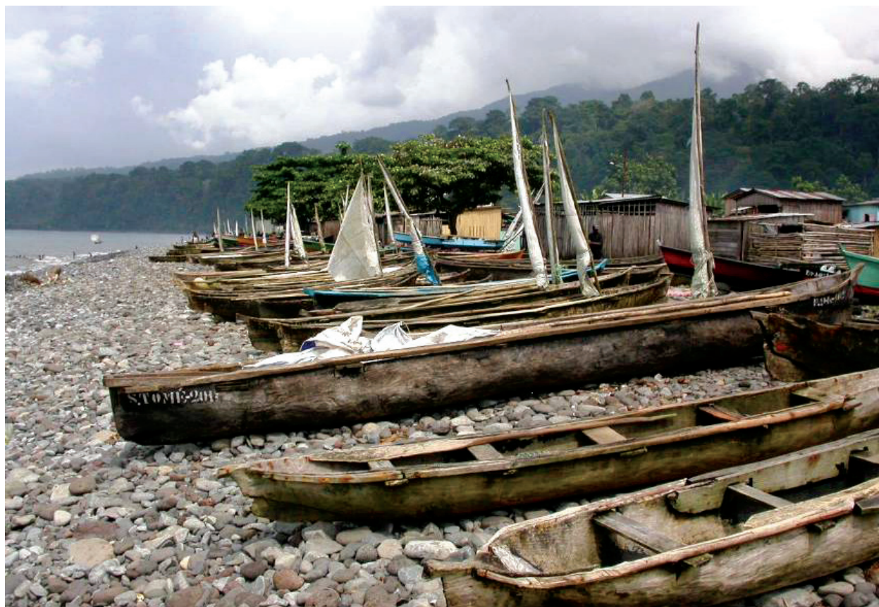
In São Tomé and Príncipe, climate change brings severe and dangerous weather conditions. Increased fog, wind, and storms are particularly dangerous for fishermen, who traditionally fish in small, open sail boats and navigate by sight. An ongoing UNDP project, in partnership with the Ministry of Public Works and the National Meteorological Institute, and with financing from the Least Developed Countries Fund, aims to help develop more reliable early warning systems to monitor these increasingly severe hydro-meteorological conditions.

Low-carbon growth offers tremendous opportunities for investment and leads to stronger, more resilient communities, increased job growth, and healthier citizens. Governments, investors and businesses are beginning to work together to mobilize global investments. Governments are sending the right signals through targeted policies and increasingly recognize that public finance alone is not enough: they also need to mobilize public finance to unlock private investment. As-