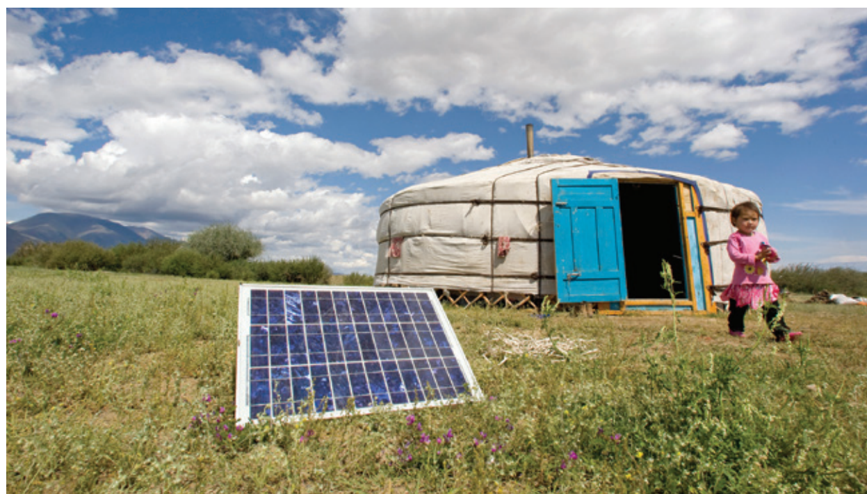
A family in Tarialan, Uvs Province, Mongolia, uses a solar panel to generate power for their ger, a traditional Mongolian tent.

Drawing on the best available science, Governments have recognized that the average global temperature must rise by no more than 2°C above pre-industrial levels if dangerous climate change is to be avoided. This can be achieved if global emissions peak within the coming decade and then decline until there are no new net emissions as early as possible in the second half of the century. Ambitious action is needed, and it is needed now. Fortunately, there are at least three good reasons to have confidence in our ability to meet the challenge: