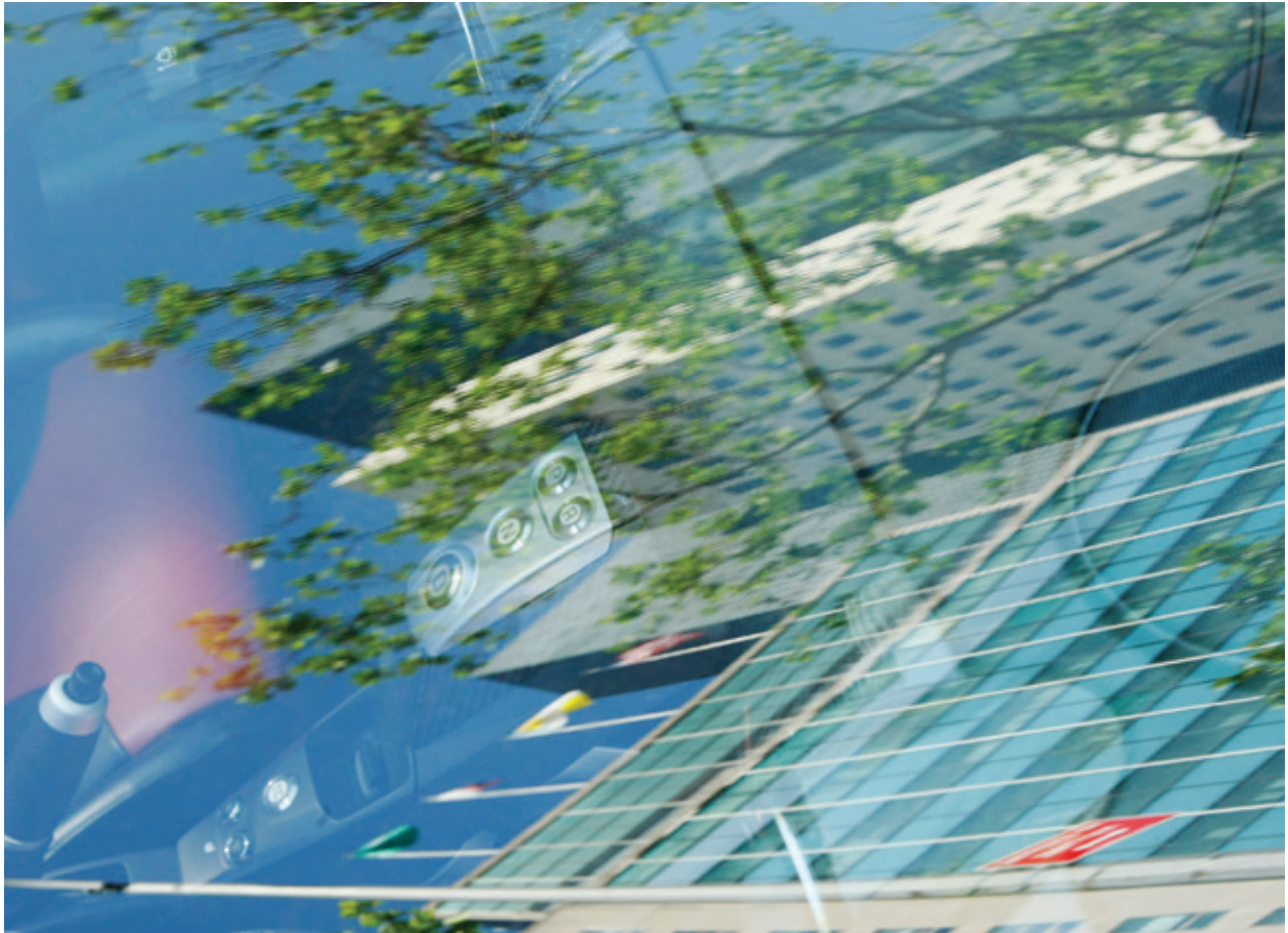
Reflection of the United Nations Headquarters building seen from the windshield of one of the electric cars parked at the UN.