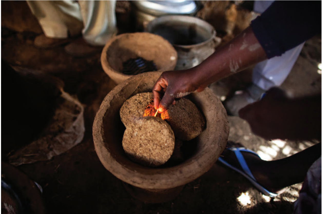
A woman fires a fuel-efficient stove made in the Rwanda camp for internally displaced people in North Darfur. Thousands of women at the camp are the beneficiaries of the Safe Access to Firewood and Alternative Energy (SAFE) project, run by WFP.

helping to develop capacity on managing climate and health, climate and energy, climate and food security, climate and human mobility, and much more.