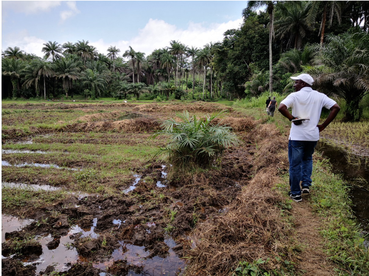
Rice paddy fields developed by the Smallholder Commercialization Programme, Sierra Leone.

The programme did not anticipate that developing the swamps would lead to fewer fires. This is an unintended positive side-effect for the environment. These positive results for both farmers and the environment suggest the inland valley development