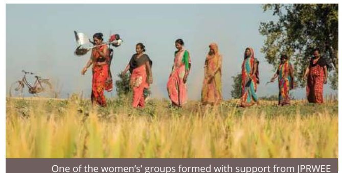
One of the women's' groups formed with support from JPRWEE