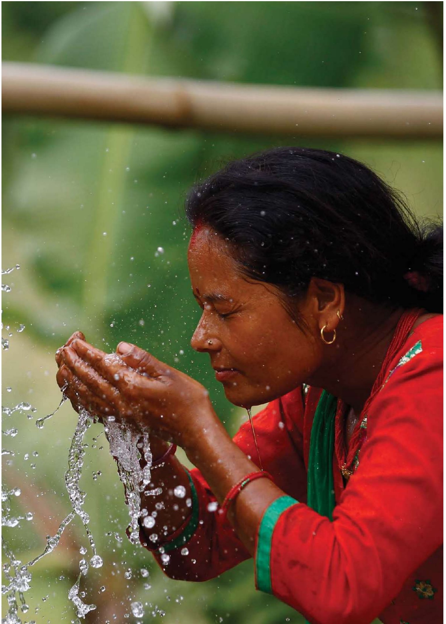
A woman washing her face at one of the water fountains built with support from JPRWEE in Nepal