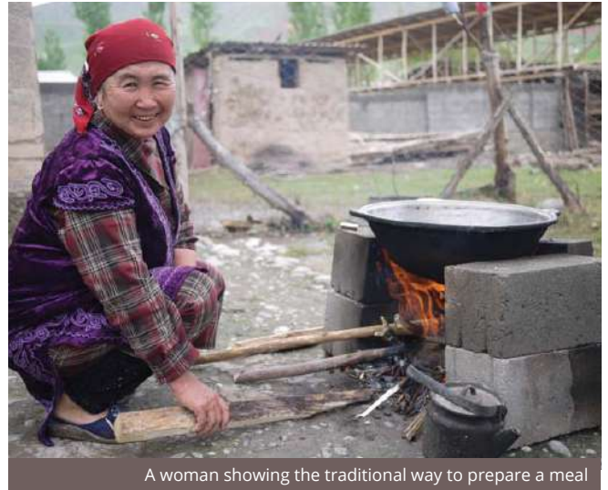
A woman showing the traditional way to prepare a meal

JPRWEE is working with targeted populations in approximately 75 villages across the Chui, Naryn, Osh, Jalalabad and Batken Provinces. Programme participants include 2,700 women and 31 men, but JPRWEE expects to reach an additional 4,725 rural women and men through the Gender Action Learning System (GALS), a community-led empowerment methodology that helps household members build their vision for the future and define strategies to achieve it. Programme participants include officials of 34 target municipalities and key national government ministries.