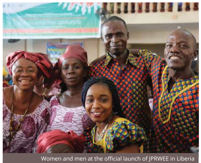
Women and men at the official launch of JPRWEE in Liberia

JPRWEE is delivers a comprehensive, sequenced package of core interventions to support women's economic and social empowerment through a combination of direct implementation and on-the-ground coordination with other community-level programming actors. The package covers a range of areas, including changing social norms, agricultural development, literacy and numeracy training, business development and management skills, and access to credit.