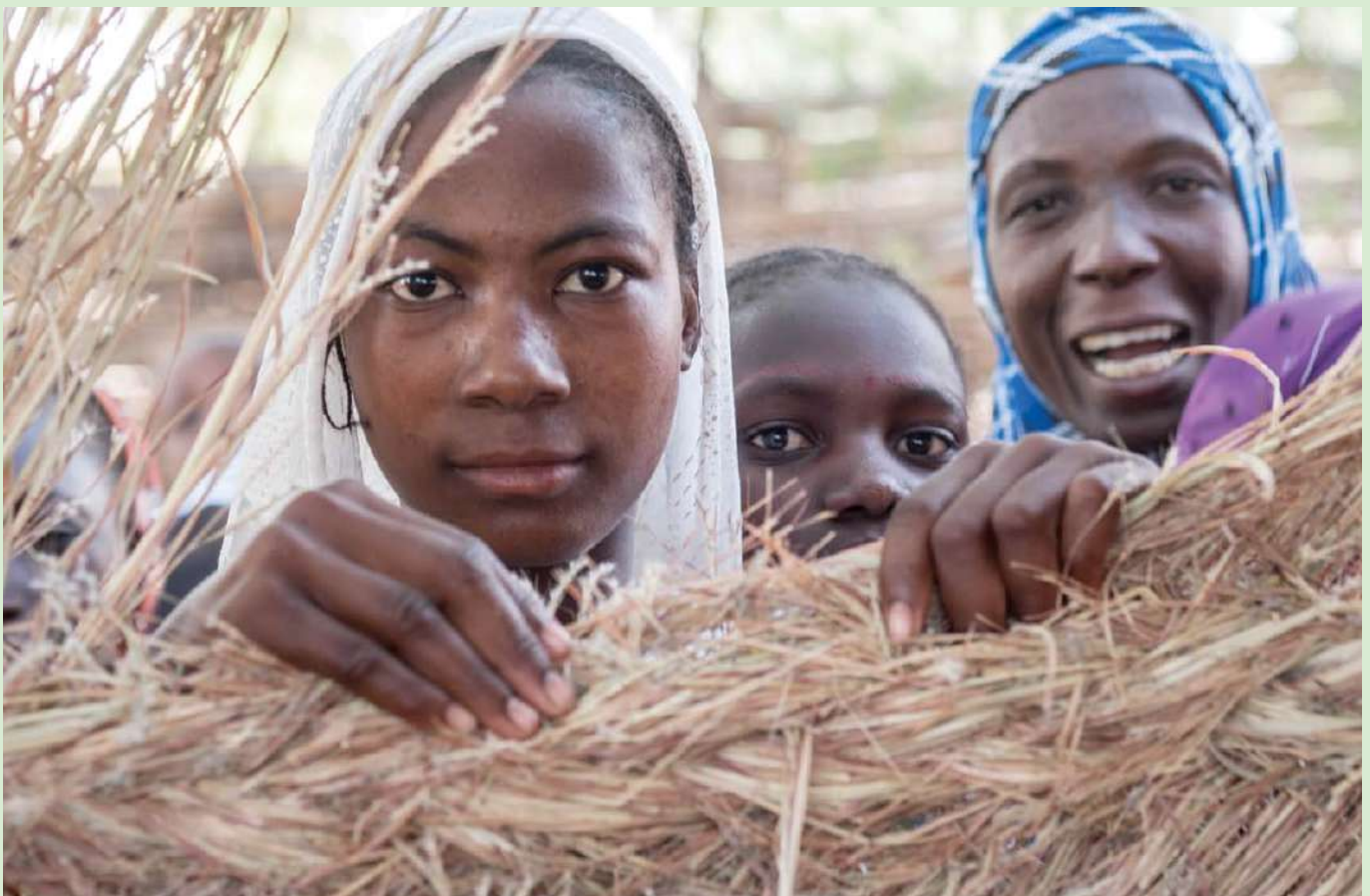
Women and girls participating in JPRWEE

“ We allowed them to pay with their millet or other cereals so they can still take advantage of the grinding and threshing. We will then sell the cereals to pay for the running costs of the machine, so we can continue managing it even after the programme ends and invest in other labour-saving technologies, for example to reduce the time we spend fetching water or firewood. ”