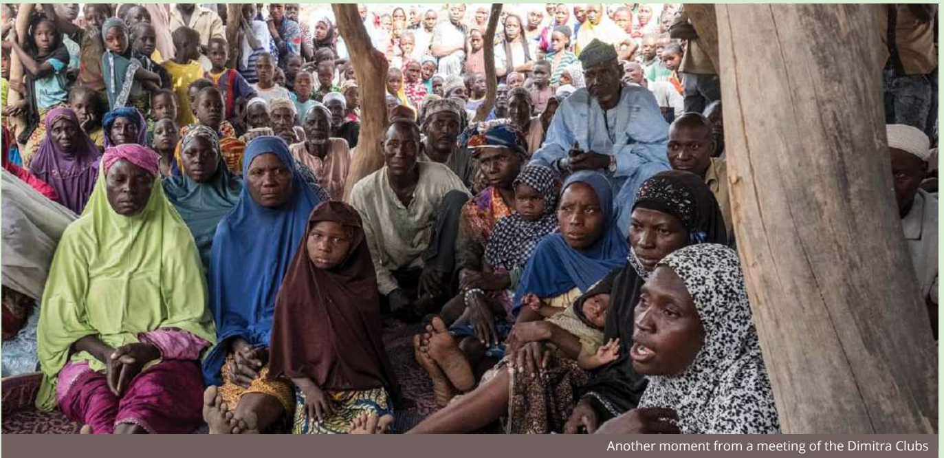
Another moment from a meeting of the Dimitra Clubs

“ First of all, it's thanks to the Clubs that the women of my village and the surrounding area have understood the importance of antenatal consultations, exclusive breastfeeding, vaccinations and a great many other things, and that's an important step forward in our rural environment. Secondly, thanks to the Clubs, we have understood the importance of peace, social cohesion and gender relations. I am the Secretary General of the Decentralized School Management Committee (COGES) in my village. I must confess that I did not really understand the role I had been given, but since last year, I have understood both my role and responsibilities. ”