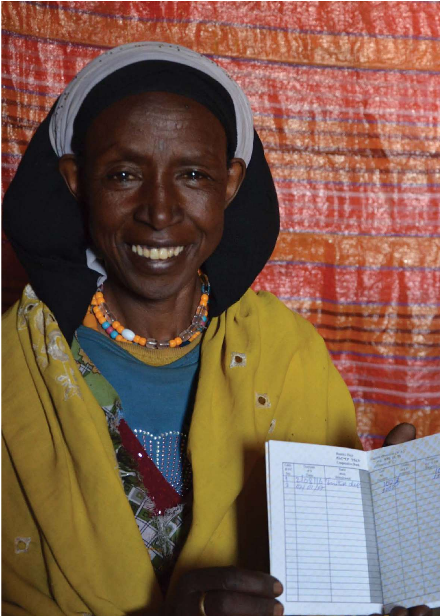
One of the women who received credit from JPRWEE in Ethiopia showing her savings book