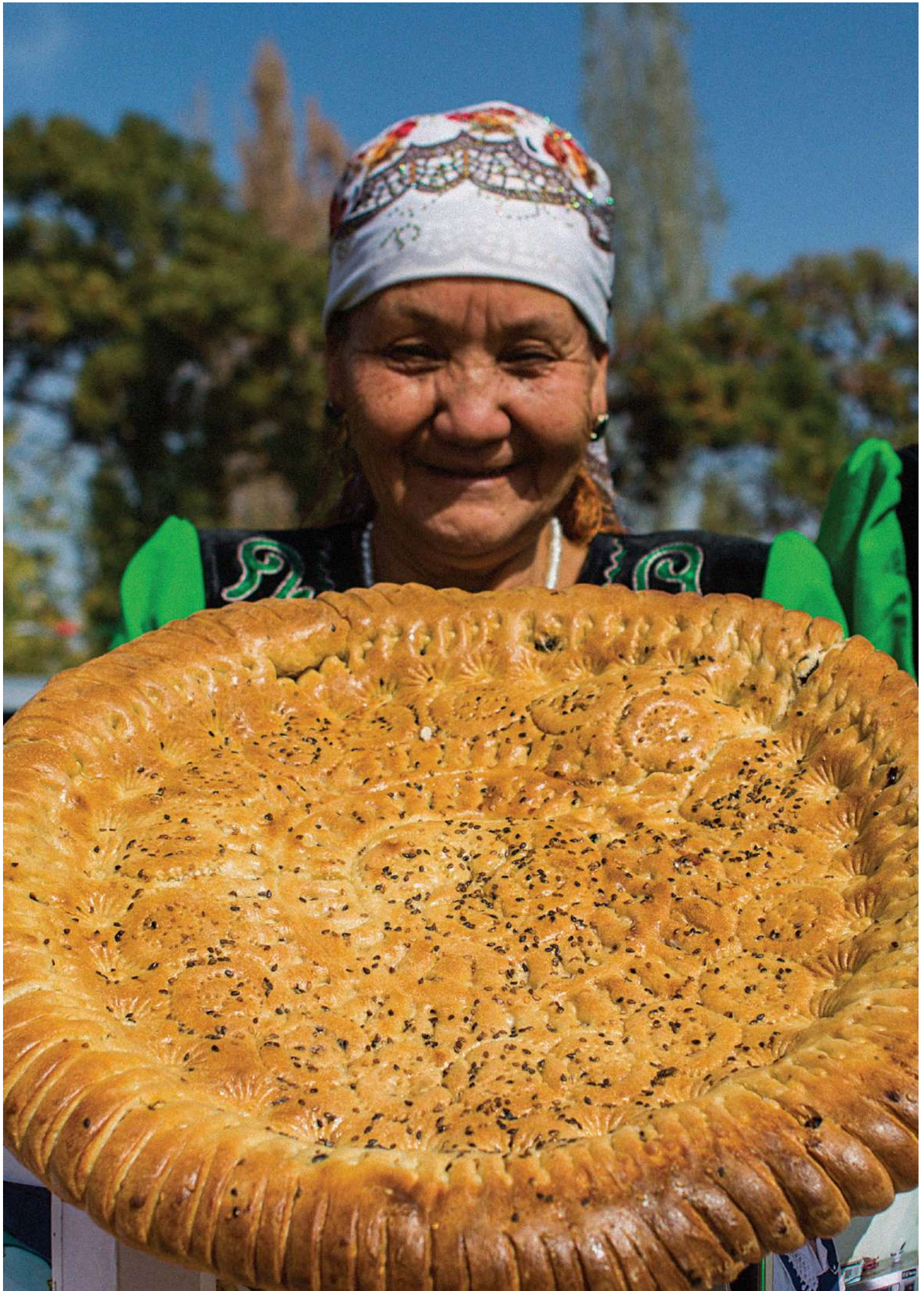
A woman at the annual harvest fair in Kyrgyzstan with the bread produced in the bakery opened with support from JPRWEE