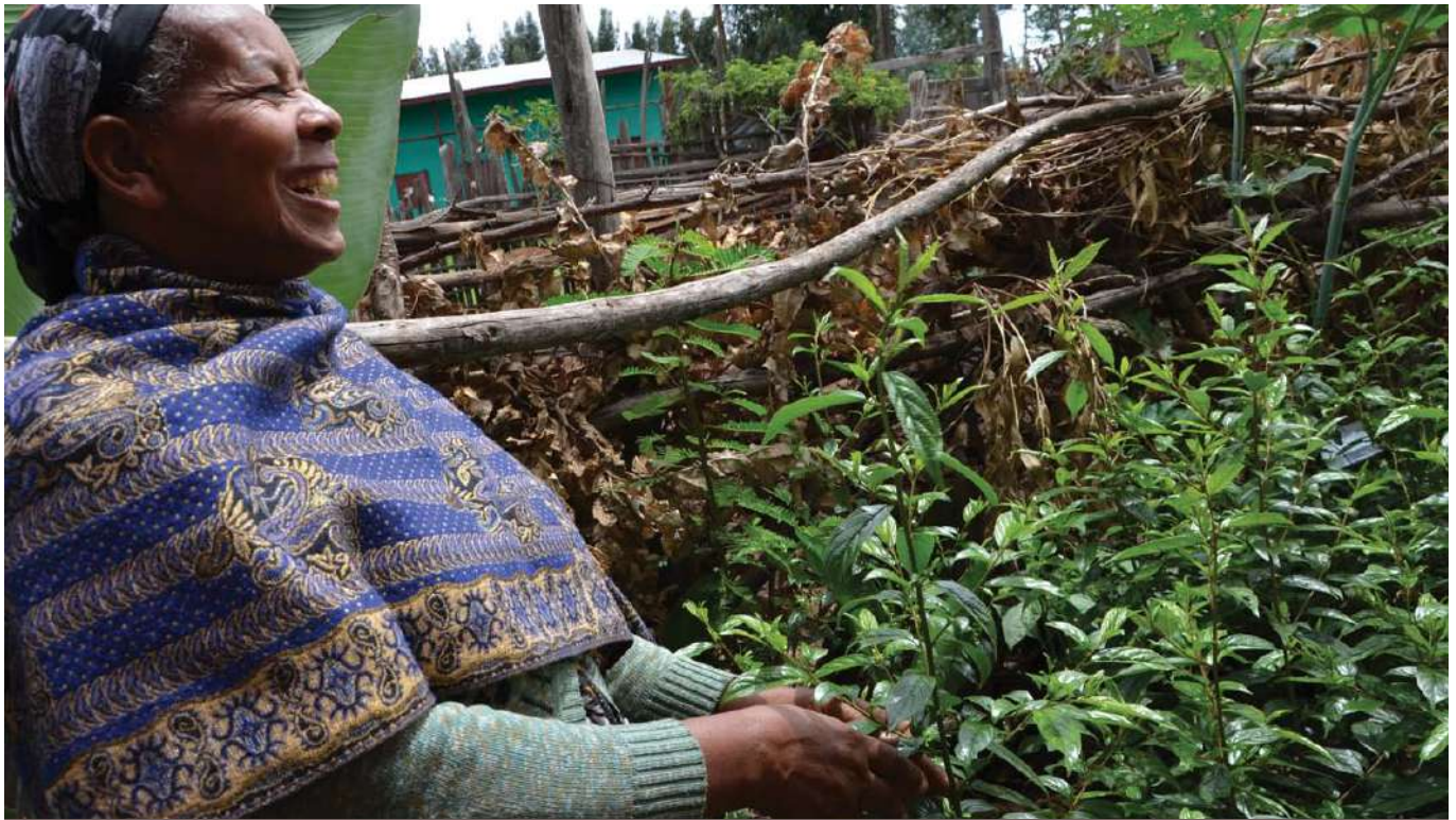
A woman participating in JPRWEE in her small vegetable garden in Dodola, Ethiopia

Rural women play a critical role in supporting food and nutrition security. The income they generate is vital to improving the livelihoods and overall wellbeing of a chain of people. They are key agents of change, central to the achievement of Agenda 2030 — the internationally agreed framework for sustainable development based on a vision of a fairer, more prosperous and peaceful world.