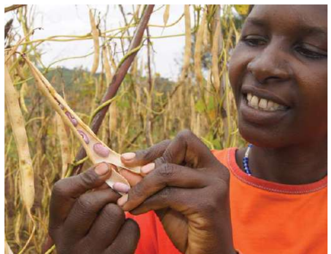
Women participating in JPRWEE