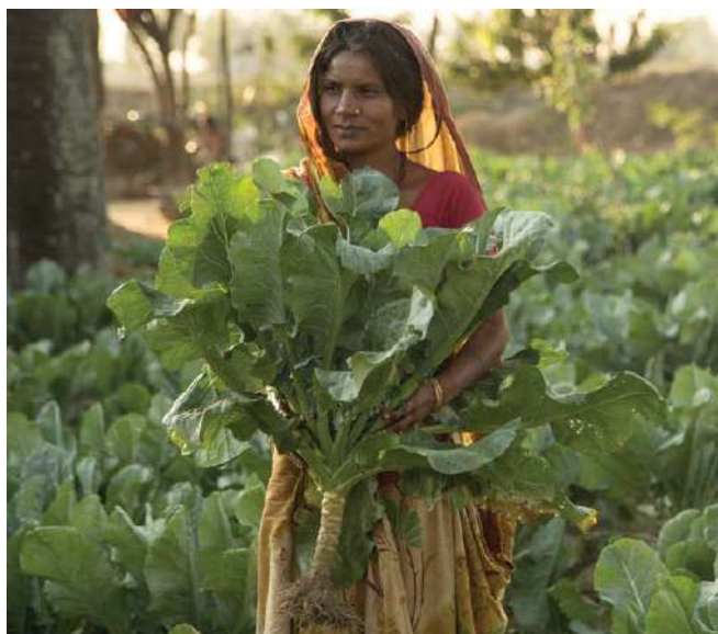
A woman showing the results of her increased yields in Sindhuli, Nepal

Launched in 2012, JPRWEE is the leading collaborative initiative uniting these four partners, working together in seven participating countries: Ethiopia, Guatemala, Kyrgyzstan, Liberia, Nepal, Niger and Rwanda.