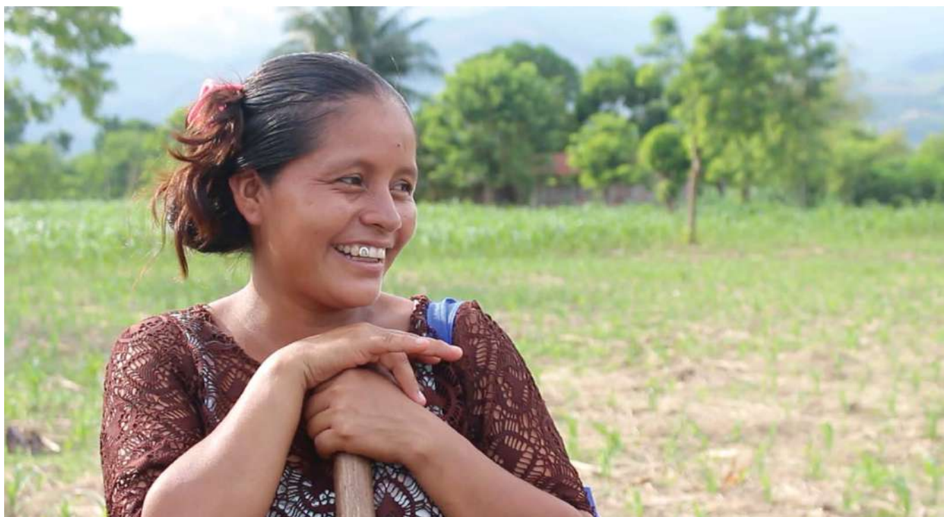
One of the JPRWEE participants photographed on land she is cultivating with her group in Polochic, Guatemala

Inspired by the women JPRWEE works with hand in hand, this collection of success stories seeks to capture some of their diverse voices and to illustrate the changes in their lives.