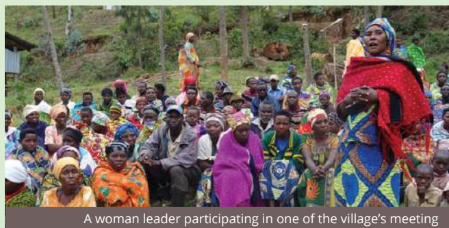
A woman leader participating in one of the village's meeting

In 2016, JPRWEE arrived in Josephine's village, aiming to help rural women through on- and off-farm job creation and strengthening market opportunities. Through the Farmer Field School (FFS) approach — participatory capacity-building for efficient, sustainable and inclusive food production systems — Josephine received support in the form of sensitization and training on nutrition, hygiene and skills for starting a business. After receiving fortified bean seeds, a young pig, and training on establishing a kitchen garden, she rented a field to grow beans.