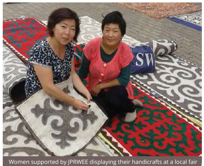
Women supported by JPRWEE displaying their handicrafts at a local fair