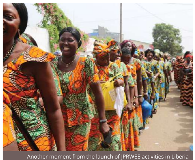
Another moment from the launch of JPRWEE activities in Liberia