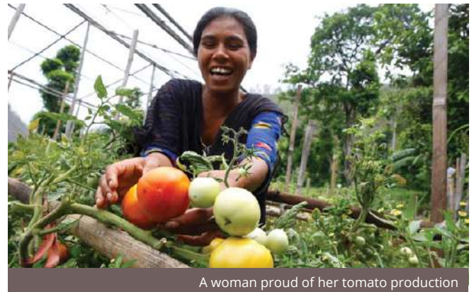
A woman proud of her tomato production

JPRWEE Nepal supports activities including commercial fresh vegetable production, leadership strengthening, initiatives promoting access to capital, the creation of saving groups, and nutrition training. Moreover, in terms of institutional strengthening, rural women's groups created through JPRWEE have been registered in the District Agriculture Development Office and three fully operational Community Agriculture Extension Service Centres have been established and handed over to the Government, ensuring the sustainability of the programme activities.