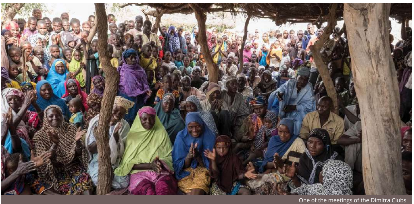
One of the meetings of the Dimitra Clubs

JPRWEE activities in Niger focus on strengthening the capacities of programme participants in participatory communication, nutrition education, gender and governance of producer organizations. Access to productive assets, including labour-saving technologies for women, and support to income-generating activities are also part of the integrated approach taken by JPRWEE in Niger, which is using Dimitra Clubs to promote social cohesion and greater dialogue among women and men. Dimitra Clubs are groups of women, men and young people – mixed or not – who decide to organize themselves so as to work together to bring about changes in their communities.