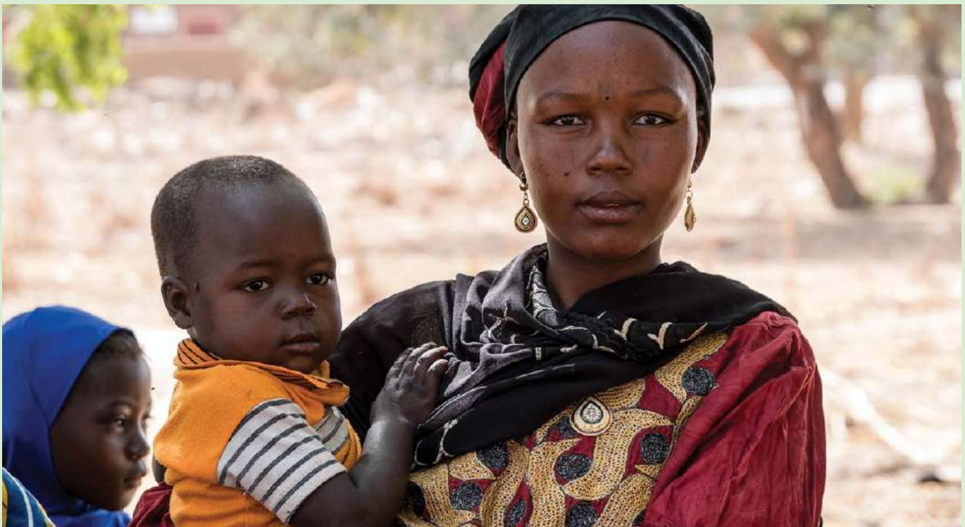
A woman and her child attending one of the nutrition workshops organised by JPRWEE

“ We learned a great deal about malnutrition and the role of food in our bodies and we are happy to pass this knowledge to other people so we are all going to pay closer attention to the food we give to our children. ”