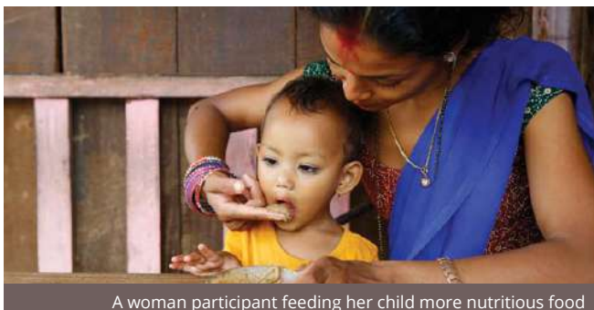
A woman participant feeding her child more nutritious food

Nepal's 20-year Agriculture Development Strategy (ADS) is committed to including women, disadvantaged groups and geographically disadvantaged populations throughout planning, implementation and monitoring. The ADS vision is of a self-reliant, sustainable, competitive and inclusive agricultural sector that drives economic growth and contributes to improved livelihood and nutrition security.