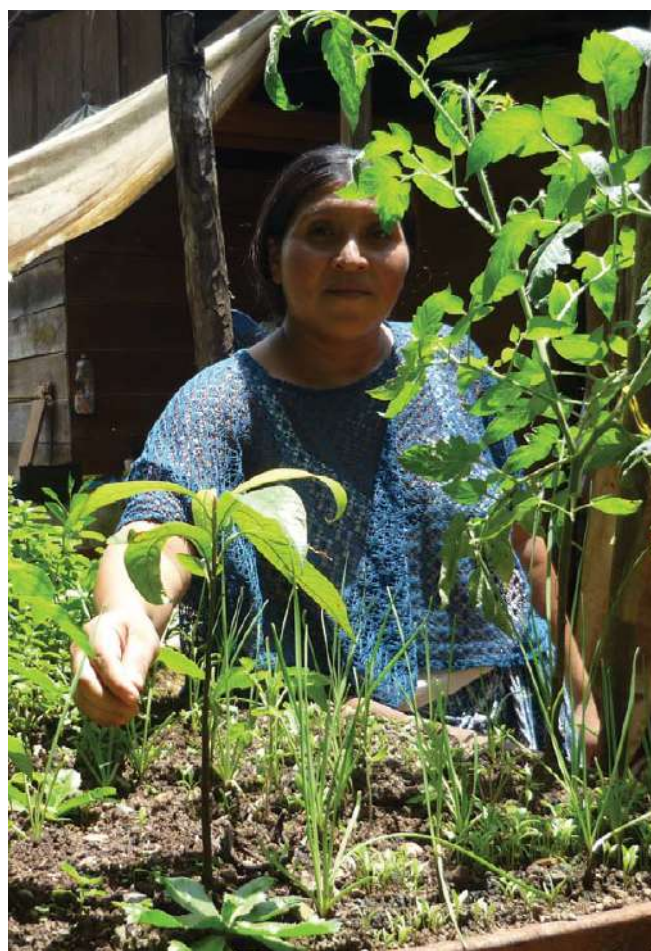
A woman participant proud of her nursery production of local vegetables

The programme is working with women participants to strengthen their technical knowledge on agriculture and food security, to improve the quality and quantity of their agricultural production, and to enhance their access to markets. The support provided includes literacy and leadership courses and working with women to reinforce their entrepreneurial capacities in off-farm income-generating activities. To ensure sustainability, these activities are grounded in capacity-building and knowledge transfers with government representatives at the national and local levels.