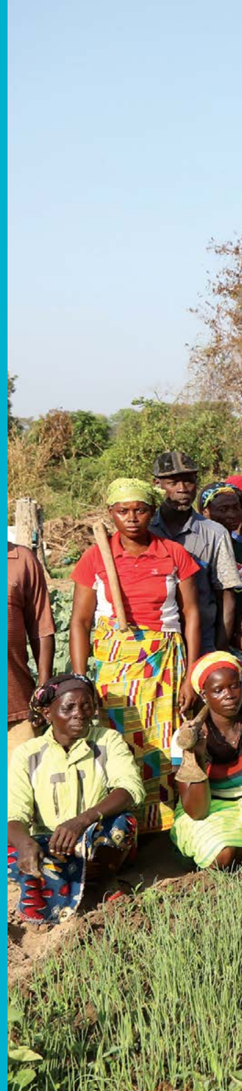
Group photo of Association of Vegetable Producers (WOPININ) members and families

In Côte d'Ivoire, agricultural development projects have traditionally focused on boosting productivity, even as investments in post-harvest activities have remained low. Supported by the International Fund for Agricultural Development (IFAD), the Agricultural Value Chains Development Programme (PADFA) seeks to improve post-harvest activities (packaging, storage, processing and marketing) for the strategic value chains of rice, vegetables and mango. PADFA works in the regions of Bagoué, Gbêkê, Hambol, Poro and Tchologo, where production has been low. Farmers' fields were vulnerable to the effects of climate change, and frequent intrusion by insects left many of their crops destroyed.