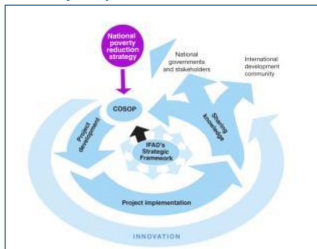
IFAD Project Cycle schematic

IFAD's operating model comprises a project cycle with two main components. Project development includes the project concept note, detailed project design and design completion. Project implementation includes supervision, the mid-term review and project completion. The phasing of projects is done on the basis of the COSOP and following a programmatic approach where feasible.