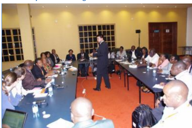
The 'Kenya' table during the FAFO break-out session.

The RSC will meet and report on the status of implementation of the action plans towards early 2018.