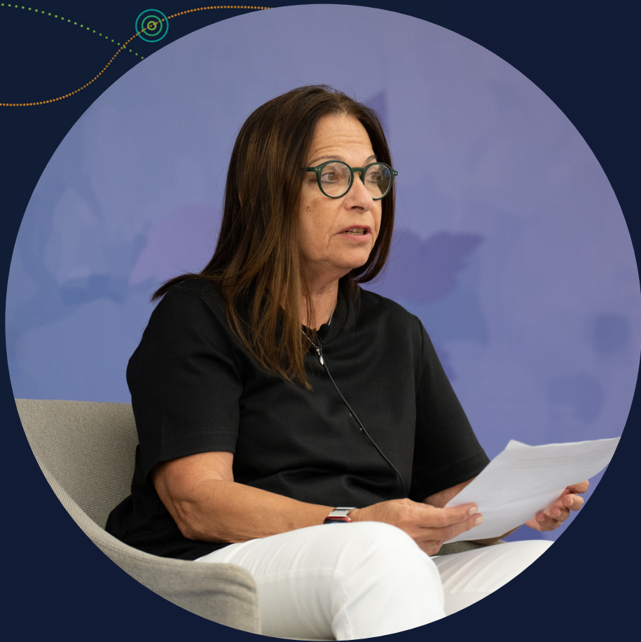
H.E. Yael Rubinstein, Ambassador, Permanent Representative of Israel to the United Nations Agencies in Rome