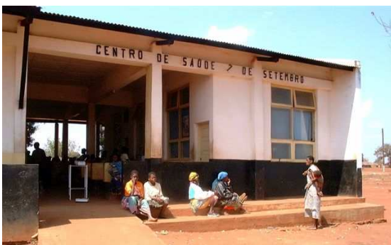
Health Center in Sanga district rehabilitated with NADP support.

Many persons left the area during the war and it was not known how many would return. Current data that would have provided an indication of the size of the population were not available at the design stage, and thus the population of the project area was overestimated by 100 per cent. The appraisal report estimated that about 45,000 households would be farm-dependent and poor, thereby constituting the initial target group, and would increase to 52,600 by the end of the project period. This was a serious discrepancy: when IFAD revisited the project design late in the implementation period, the target group had been reduced to 30,000 households. This not only had an impact on the targets set for components/sub-components but also on the economic rate of return, which at appraisal was optimistically estimated at 16 per cent.