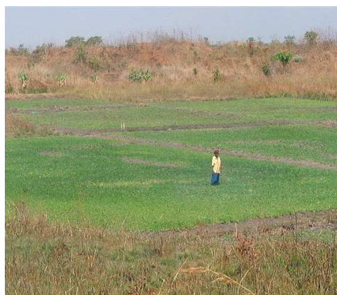
Farmer's field in Lichinga

Despite an adequate training budget under NADP, this was not sufficiently utilized and little was done at the outset to define implementation rules and procedures or to provide training. In post-conflict and post-emergency situations, there is a natural urge to deliver on-the-ground as quickly as possible and therefore jump into implementation without first establishing a solid foundation. Investments in staff training may be considered as 'delivery costs': for a multi-sector project in a remote area, working with numerous institutions with limited capacity, these costs are considerable but necessary for achieving impact.